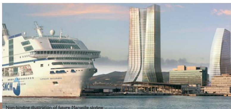
Non-binding illustration of future Marseille skyline

Georges Charpak , the Ecole Centrale de Marseille ) and business schools such as Euromed Management . The region is home to nearly 80,000 students enrolled in first-class educational programs which are adapted to the requirements of today's businesses.