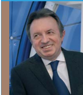
Jean-Noël Guérini President of Provence Promotion Senator of the Bouches-du-Rhône Department President of the Bouches-du-Rhône General Council

Contributing to building a regional economy that attracts new business investment is one of the key priorities set by the Bouches-du-Rhône Conseil Général. The Conseil Général promotes the region's economy by continuing to support existing assets and by investing in public amenities and infrastructure facilities, with a particular focus on transportation and multi-modal transit infrastructures. Their mission is to strengthen the region's international, European and Mediterranean perspectives as well as its competitive advantages. In partnering with the Marseille-Provence Chamber of Commerce and Industry, the Conseil Général provides tangible support for economic development and a tool for ensuring long-term job creation. Through its support for businesses moving into the area, Provence Promotion's work is consistent with the ambitions of the Conseil Général to support the Bouches-du-Rhône economy and community.